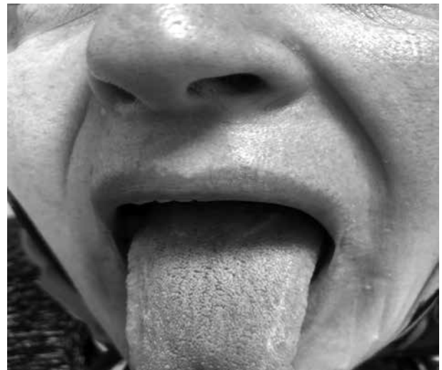
Figure 2. Appearance of tongue two weeks later.

She did not have xerostomia. She was non-alcoholic and non-smoker, with no history of drug intake except prednisolone. She reported that similar color change and appearance developed in previous oral systemic glucocorticoid use. The previous appearance developed after 10 days of glucocorticoid use and hairy-like appearance resolved after two weeks. She did not brush her tongue or use any topical ointment for the first appearance. There were green-brown hairy-like projections on the middle and posterior one-thirds