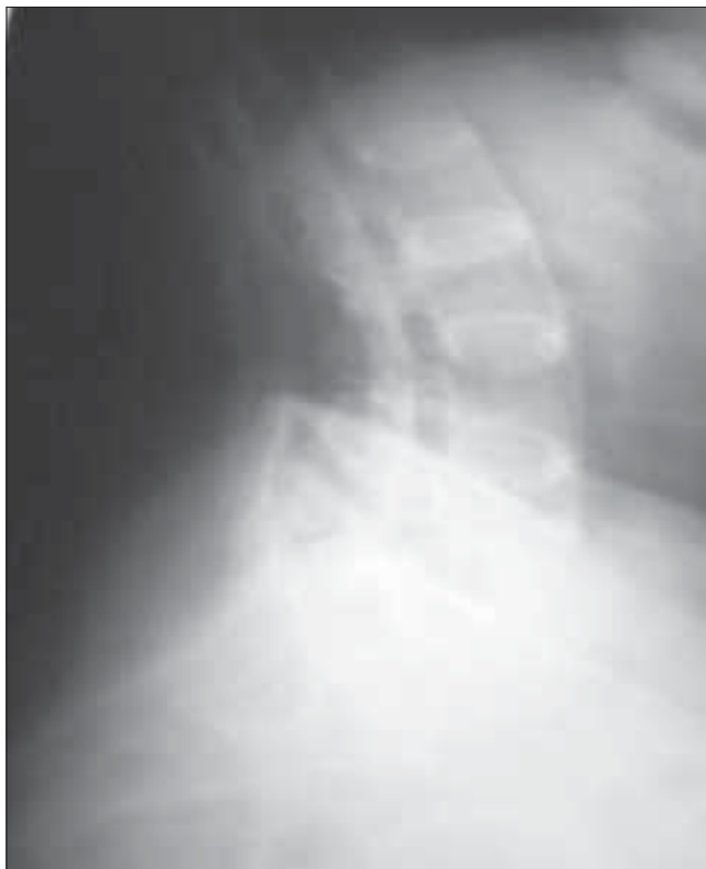
Picture 2. Lumbosacral X-ray