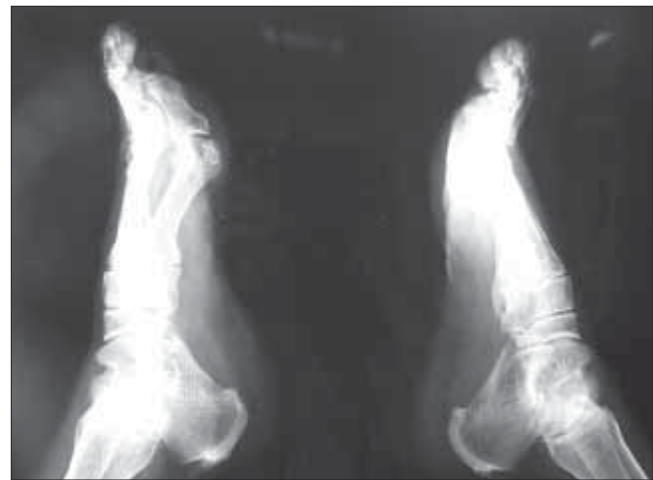
Picture 3. Calcaneal X-ray