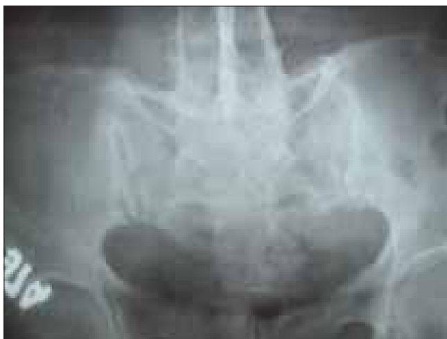
Picture 5. Conventional sacroiliac X-ray