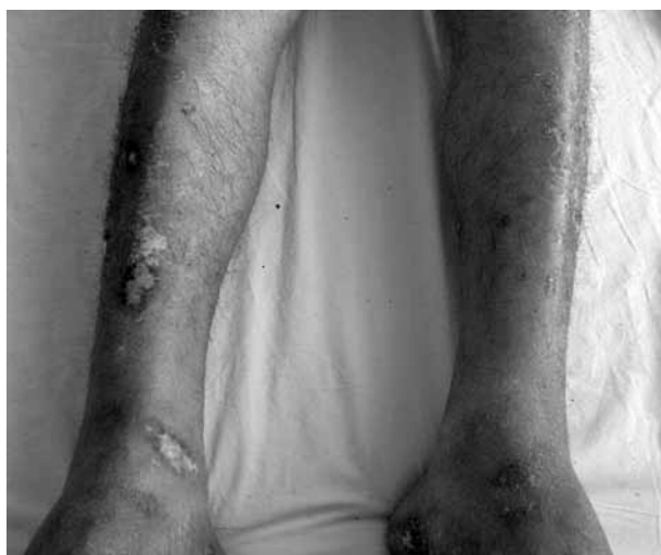
Figure 1. Violaceous pruritic papules with hyperkeratotic surface on the left ankle.

examination revealed tenderness and pain in both hands. Patient's laboratory findings are presented in Table 1. Blood tests revealed anemia with hemoglobin of 10.7 g/dL, hematocrit of 32.4%, white cell count of 9.24 \mu\text{l/L} , and platelet count of 291,000 \mu\text{l/L} . Blood urea nitrogen and creatinine were 119 mg/dL and 1.48 mg/dL, respectively. Urine analyze showed proteinuria of 5.68 grams/day and microalbuminuria of 1.24 grams/day. A skin biopsy was taken and the histology showed