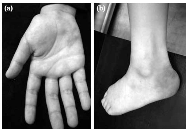
Figure 1. Indurated, erythematous plaques on (a) palm and (b) heel.

a pencil. She had no significant personal or family history. The patient also had mild reddish and scaly rashes on her elbows, which were not painful, and she could not recall when they appeared. She underwent a cutaneous biopsy on the heel, and laboratory assessments and imaging tests were performed. The patient was initially treated with antibiotics because we could not exclude an infectious origin, such as cellulitis. A written informed consent was obtained from the patient.